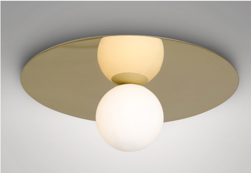
PLATE AND SPHERE CEILING / WALL