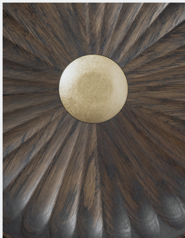
- Oak / Brass detail